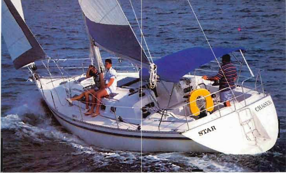
CS40 undersail in Sea of Abaco enroute to Man-O-War Cay.